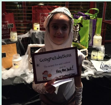
2016 Seaforth Spook Best Costume winner!